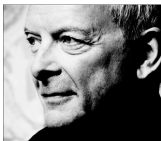
Christopher Hogwood Cambridge University

As researcher, he has designed both hardware and software based musical systems in conjunction with various universities and research centers.