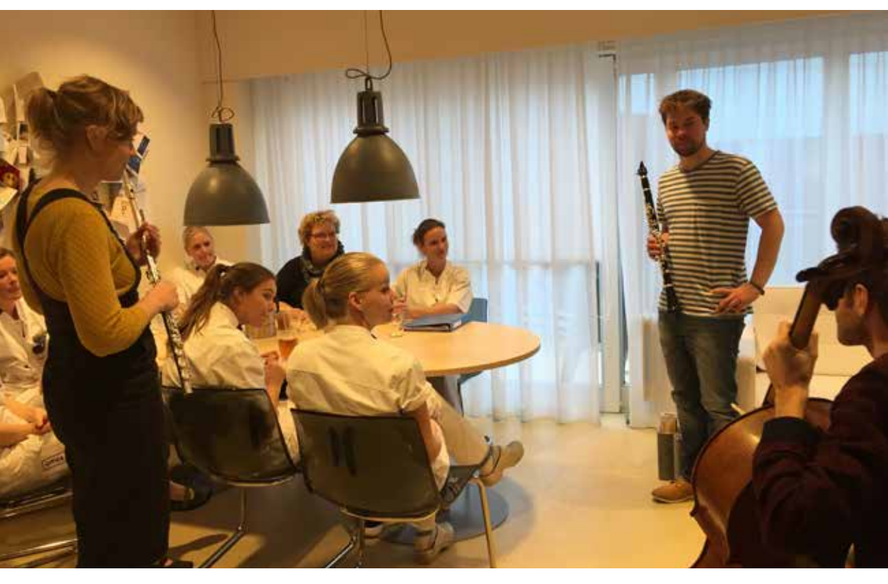
The musicians start the day playing in the nurses' room

From September 2016 to June 2017 six pilot projects took place within the framework of Meaningful Music in Health Care at the UMCG. In each pilot, small-scale, personalised musical interventions were offered to patients and health care professionals on the wards. The MiMiC-sessions took place in the morning on six or seven consecutive days in the departments Traumatology, Abdominal and oncological surgery and Vascular and hepatobiliary surgery. For the patients, the interventions in the clinical environment of the hospital offered a moment of peace, personal contact, enjoyment and distraction in a quite often-precarious situation. Especially for the nurses, who are often under great pressure, the music meant a moment of quiet and the music was able to function as a catalyst to regulate the usual commotion of the ward.