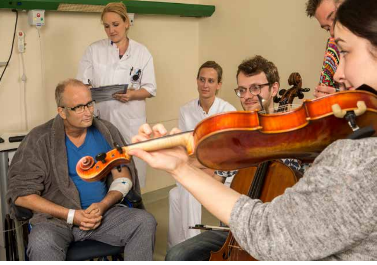
In MiMiC the focus is on person-centred music making

In the developed elective module, students first complete a MiMiC-training period of nine groupbased sessions and then take part in an internship in the MiMiC-practice at the UMCG. During the training period, each student takes part in an observation on-site during a music session, to gain first hand understanding of the nature of the practice as well as the practical (health care) setting and the musical approaches. The internship consists of six successive days on one hospital ward.