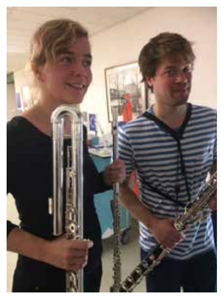
Musicians on their way to a new room