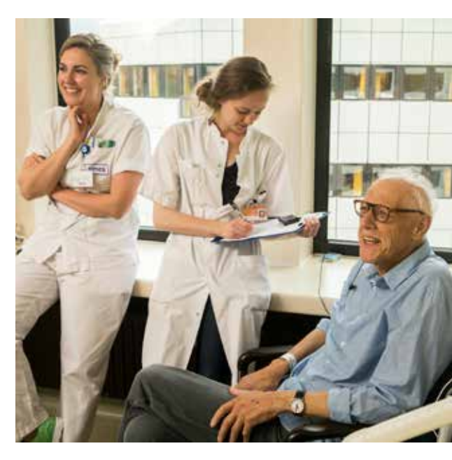
The interaction between health care professionals and patients is an important element in the musical interventions

This description portrays one of the personcentred music-making approaches of the MiMiC-practice. This is improvisation with idiomatic or genre-based characteristics. By taking this approach using Pärt's music, the musicians reconstruct and portray the essential elements of a composition that has meaning for the patient.