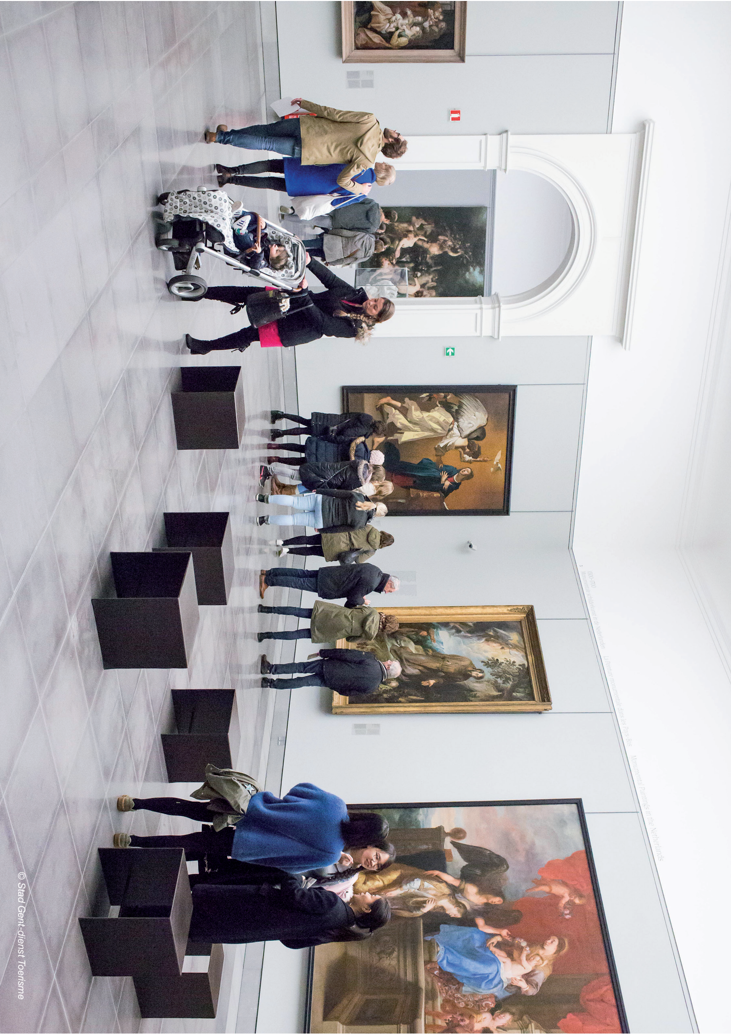
Monumental Paintings in the Netherlands La Pietà monumentale dans les Pays-Bas 1500-1700 Monumental Paintings in the Netherlands