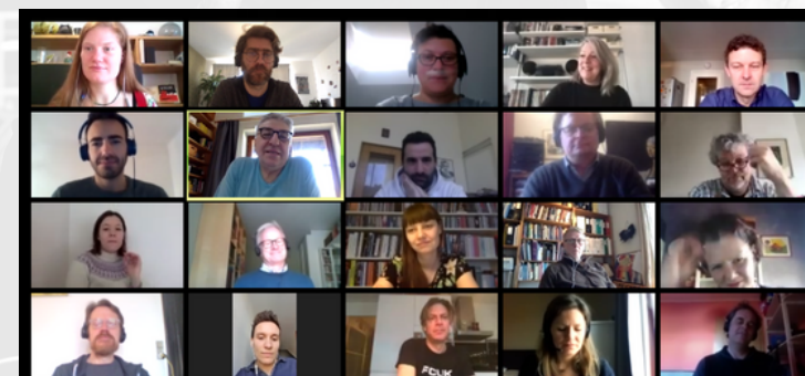
Online SMS Network Meeting, March 2020

The WG has been working on the data of a questionnaire about ongoing digitisation projects , deciding on the follow up strategy and on the dissemination. Follow up interviews will be conducted in order to gain more in depth information on the selected projects. In addition, an article presenting a set of pedagogical principles to guide future online and blended teaching was written and submitted to the international peer-reviewed journal Technology, Pedagogy and Education .