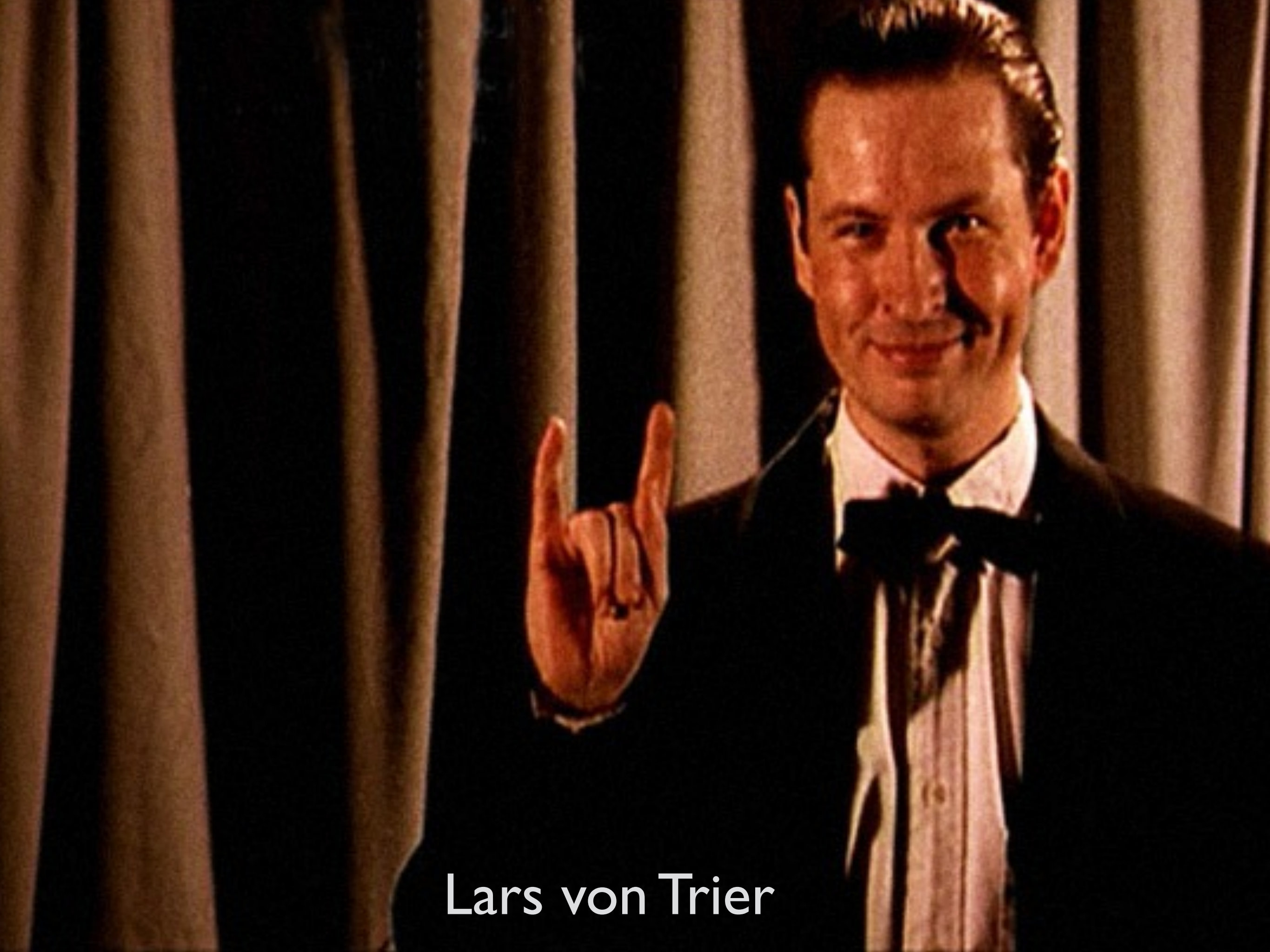
Lars von Trier