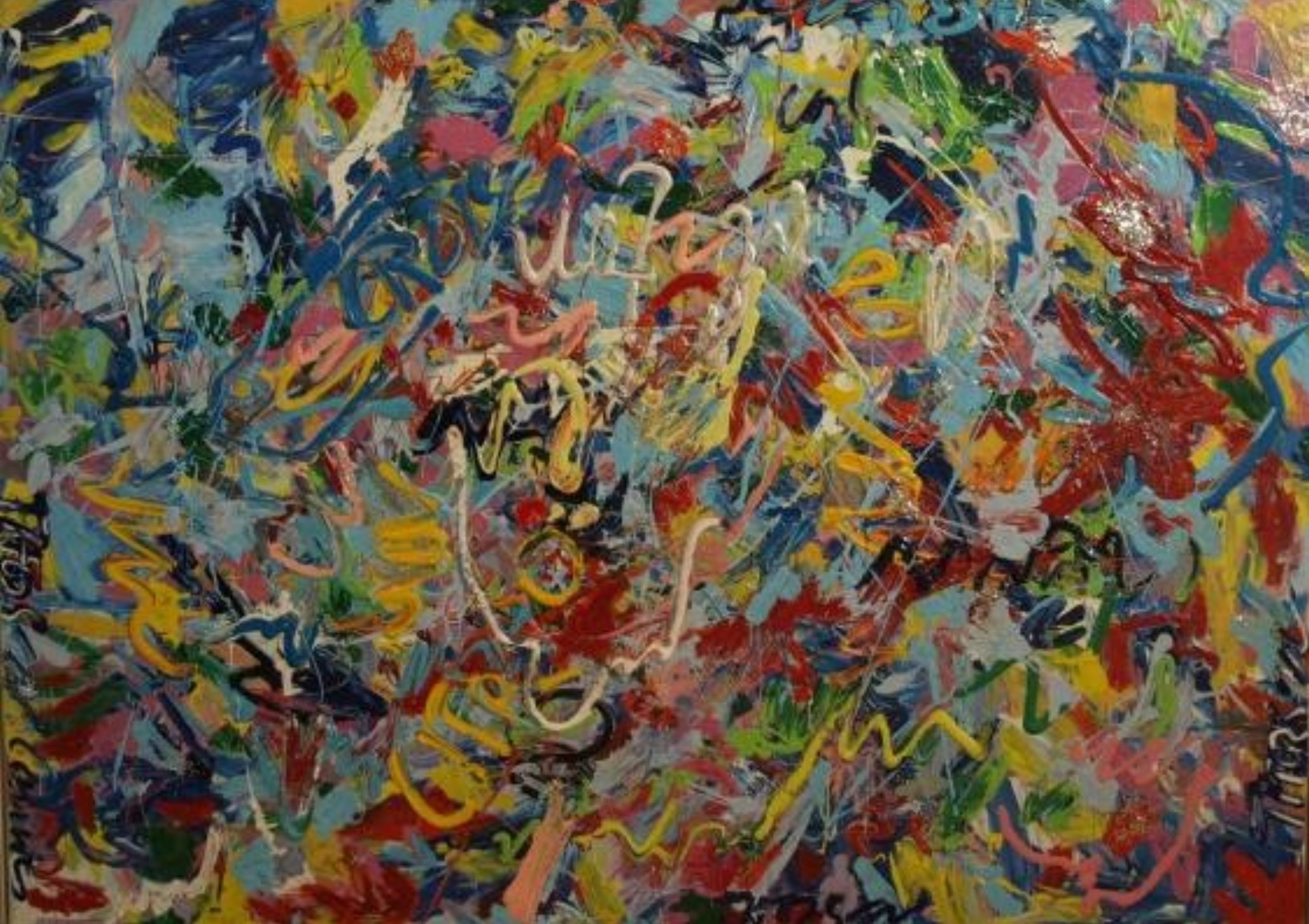
King Kong Cannes