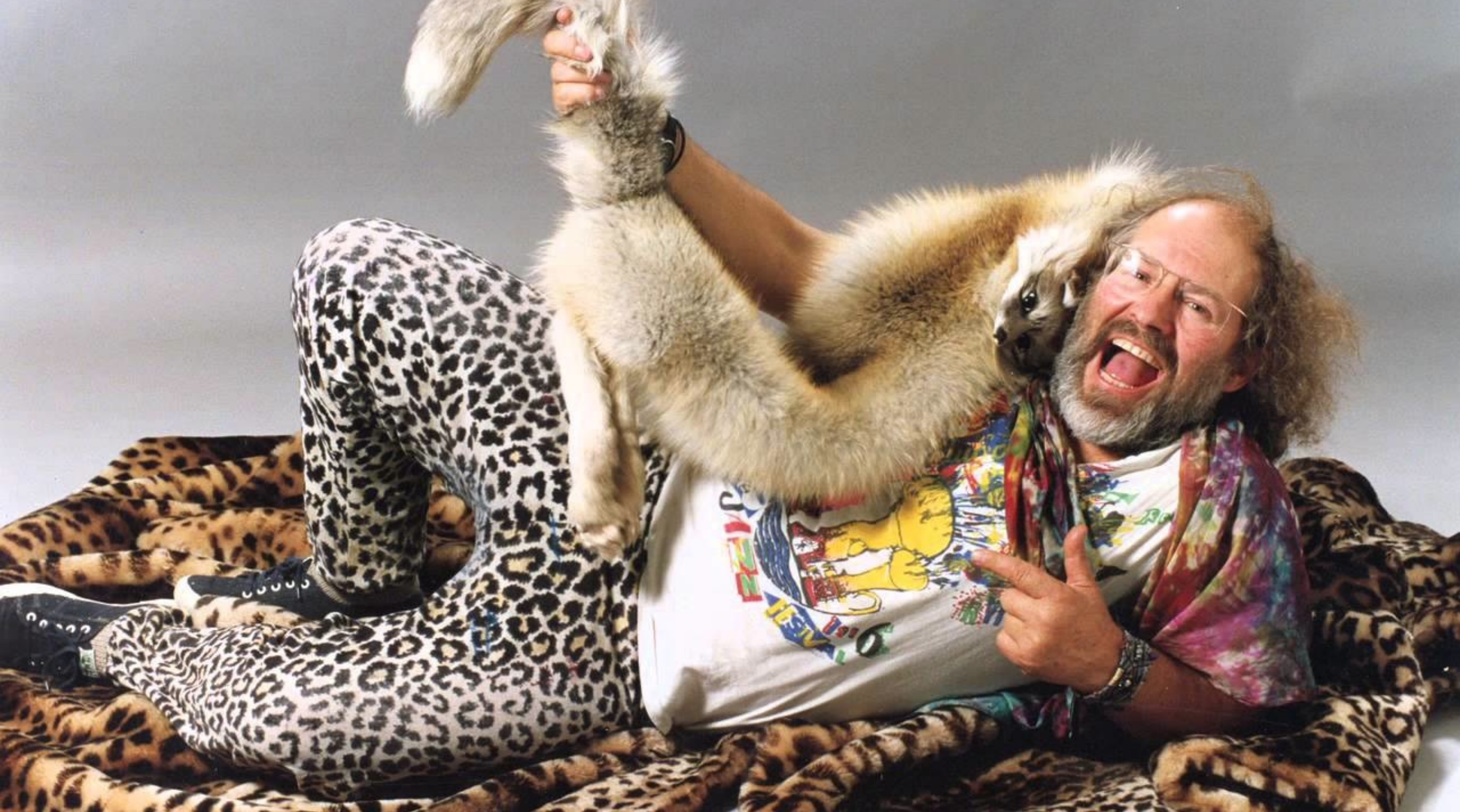
Jens Jørgen Thorsen